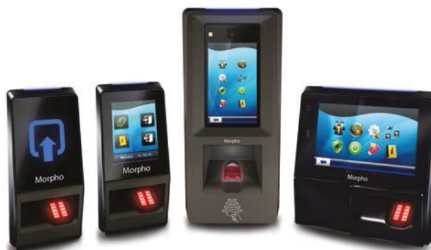
THE SIGMA FAMILY